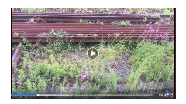
Niemon Island 9/28

This is my activity news which I felt in September. I could contact to many friends here and there and made a movies for uploading Facebook and Youtube. I am quite sure my editing ability improved little by little because LIKE reaction from FB proved it.