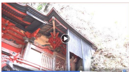
Houses are fixed with rock mountain. (See movie)

• 8/21 This video taken by me in April, 2018 at Takasaki, Gunma Prefecture.