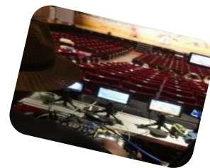
Odawara Civic Center

I have had a first experience and I feel like Odawara citizen.