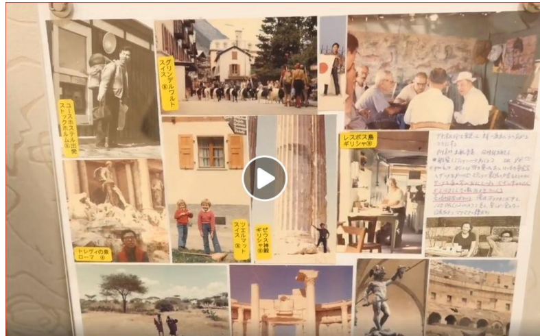
He has triped to Africa after working in Copenhargen.

• 8/06 I decided take a picture, because he is one of the important friend and truly I can do my best for his very very important last event for his life.